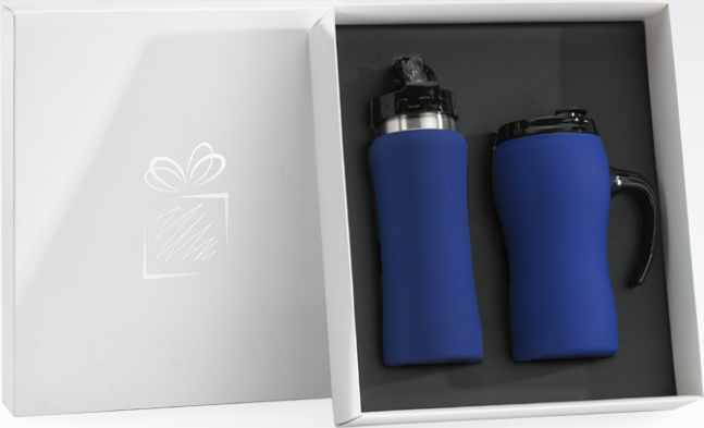
THERMAL MUG & WATER BOTTLE SET (HD01/HB01)