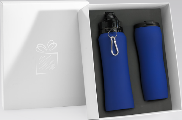
WATER BOTTLE & THERMAL MUG SET (HB02/HD02)