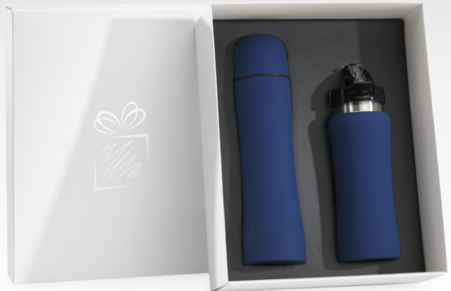
WATER BOTTLE & THERMOS SET (HB01/HT01)