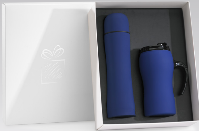
THERMAL MUG & THERMOS SET (HD01/HT01)