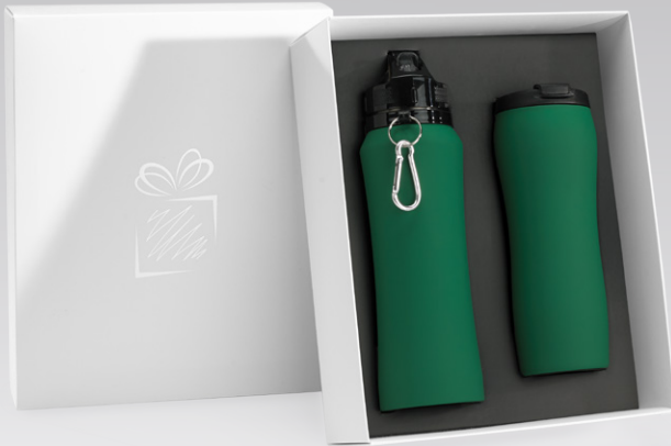
WATER BOTTLE & THERMAL MUG SET (HB02/HD02)