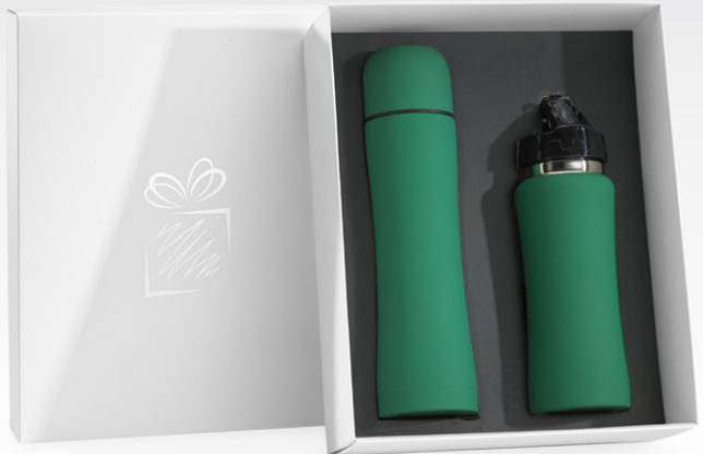
WATER BOTTLE & THERMOS SET (HB01/HT01)