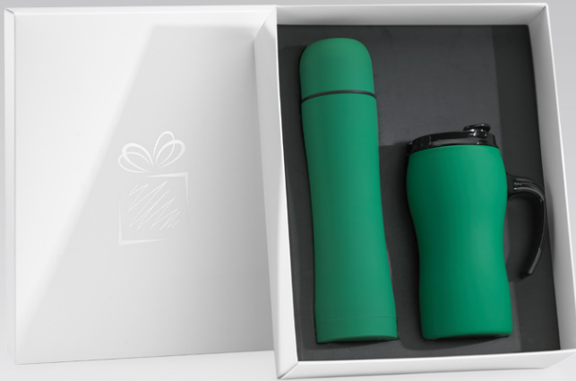
THERMAL MUG & THERMOS SET (HD01/HT01)