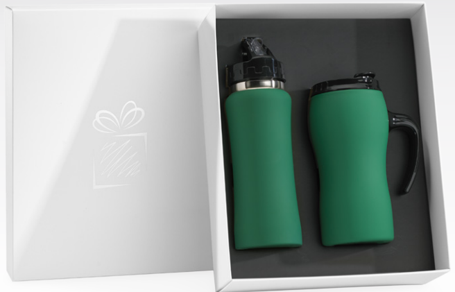
THERMAL MUG & WATER BOTTLE SET (HD01/HB01)