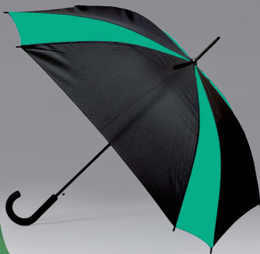
SAINT TROPEZ UMBRELLA (UP30)

A very robust umbrella from the Cambridge collection with DAS (Double Automatic System) and an antiwind system. The frame is made from metal and the handle is covered with ABS plastic for a safe grip and a nice feeling. It is ideal for women's handbags.