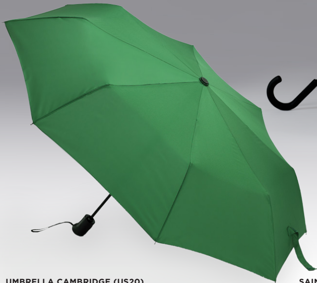
UMBRELLA CAMBRIDGE (US20)

A very robust umbrella from the Cambridge collection with DAS (Double Automatic System) and an antiwind system. The frame is made from metal and the handle is covered with ABS plastic for a safe grip and a nice feeling. It is ideal for women's handbags.