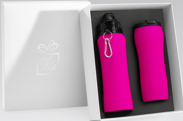
WATER BOTTLE & THERMAL MUG SET (HB02/HD02)