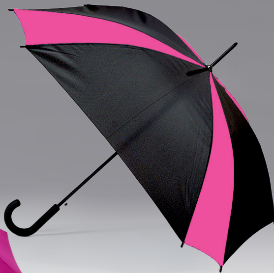
SAINT TROPEZ UMBRELLA (UP30)

A very robust umbrella from the Cambridge collection with DAS (Double Automatic System) and an antiwind system. The frame is made from metal and the handle is covered with ABS plastic for a safe grip and a nice feeling. It is ideal for women's handbags.