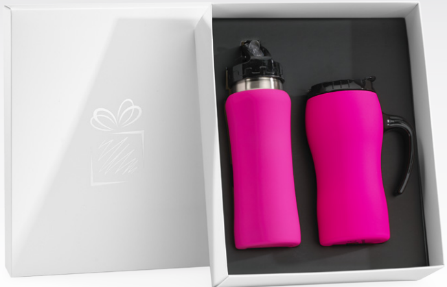
THERMAL MUG & WATER BOTTLE SET (HD01/HB01)