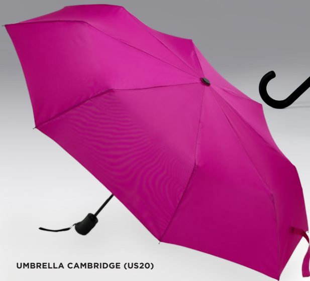
UMBRELLA CAMBRIDGE (US20)

A very robust umbrella from the Cambridge collection with DAS (Double Automatic System) and an antiwind system. The frame is made from metal and the handle is covered with ABS plastic for a safe grip and a nice feeling. It is ideal for women's handbags.