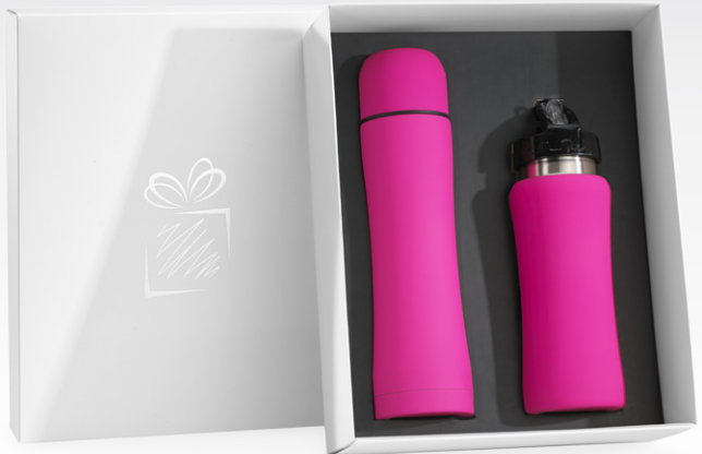
WATER BOTTLE & THERMOS SET (HB01/HT01)