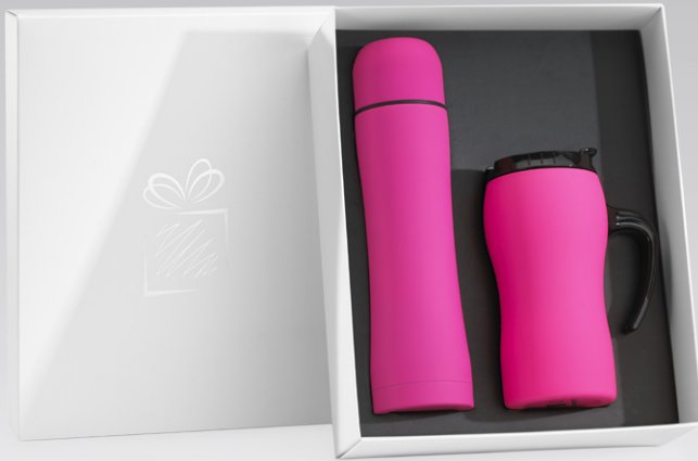
THERMAL MUG & THERMOS SET (HD01/HT01)