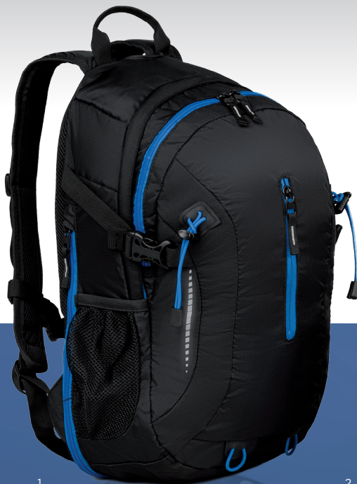
1. OUTDOOR BACKPACK FLASH L (LPN501) 2. OUTDOOR BACKPACK FLASH M (LPN525)