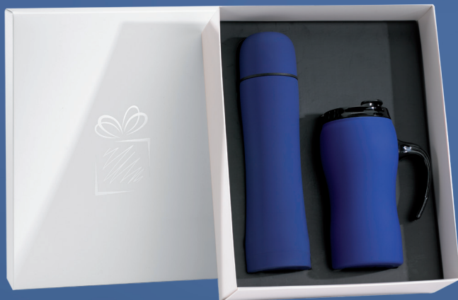
THERMAL MUG & THERMOS SET (HD01/HT01)