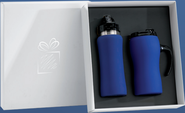
THERMAL MUG & WATER BOTTLE SET (HD01/HB01)