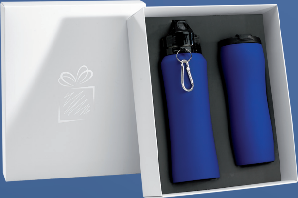
WATER BOTTLE & THERMAL MUG SET (HB02/HD02)