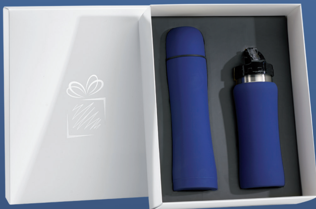
WATER BOTTLE & THERMOS SET (HB01/HT01)