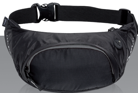
HIP BAG FLASH (LNN501)

Hip Bag from the Flash collection made of tear-resistant, very durable material. It has a capacious pocket closed with a zipper. Equipped with an adjustable strap, headphone output and air flow system on the back.