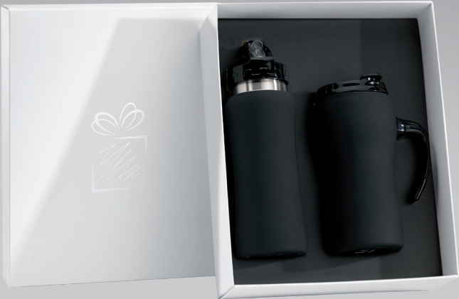
THERMAL MUG & WATER BOTTLE SET (HD01/HB01)