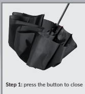
Step 1: press the button to close