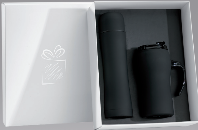
THERMAL MUG & THERMOS SET (HD01/HT01)