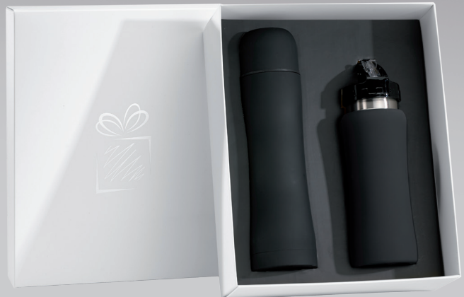
WATER BOTTLE & THERMOS SET (HB01/HT01)