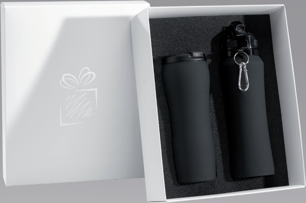
WATER BOTTLE & THERMAL MUG SET (HB02/HD02)