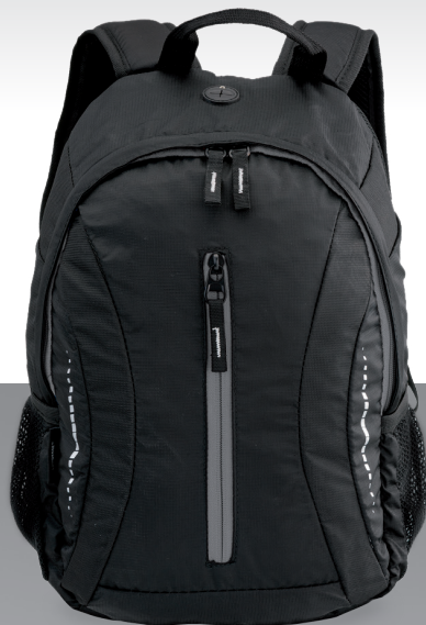
SPORT BACKPACK FLASH S (LPN550)

Sport backpack Flash S has a headphone output, breathable back, reflective elements, side mesh pockets and 1 main pocket with an internal organiser, as well as 1 small zipped pocket on the front of the backpack. Perfect for short trips.