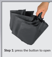
Step 1: press the button to open