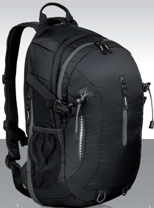
1. OUTDOOR BACKPACK FLASH L (LPN501) 2. OUTDOOR BACKPACK FLASH M (LPN525)