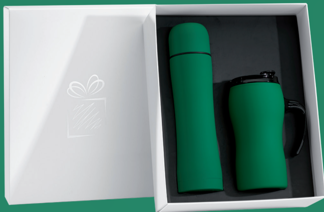
THERMAL MUG & THERMOS SET (HD01/HT01)