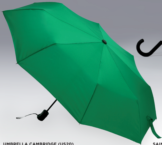
UMBRELLA CAMBRIDGE (US20)

A very robust umbrella from the Cambridge collection with DAS (Double Automatic System) and an antiwind system. The frame is made from metal and the handle is covered with ABS plastic for a safe grip and a nice feeling. It is ideal for women's handbags.