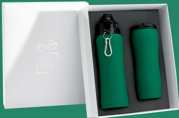
WATER BOTTLE & THERMAL MUG SET (HB02/HD02)