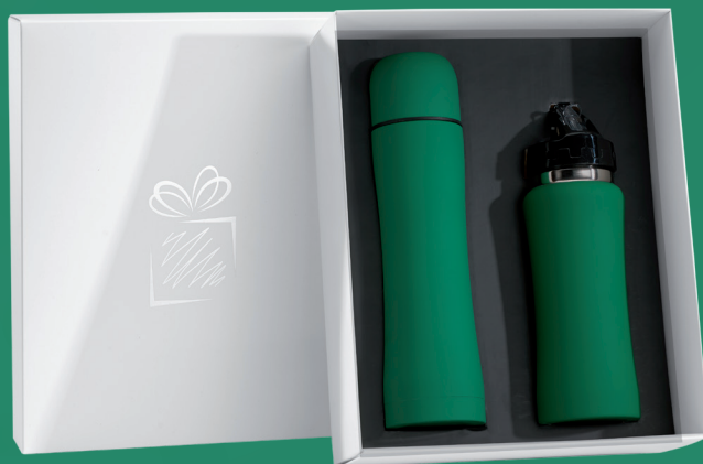
WATER BOTTLE & THERMOS SET (HB01/HT01)