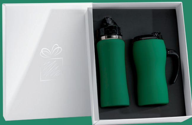
THERMAL MUG & WATER BOTTLE SET (HD01/HB01)