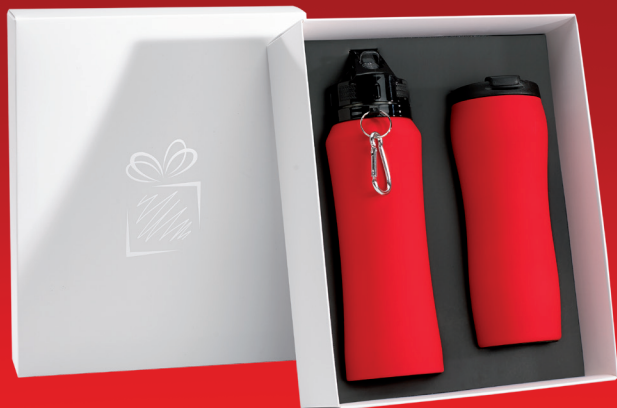
WATER BOTTLE & THERMAL MUG SET (HB02/HD02)