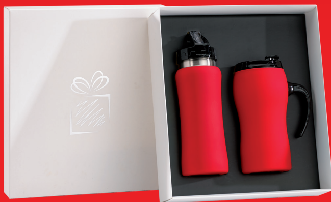
THERMAL MUG & WATER BOTTLE SET (HD01/HB01)