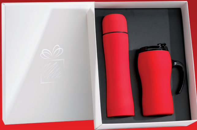
THERMAL MUG & THERMOS SET (HD01/HT01)