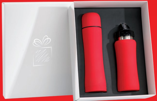
WATER BOTTLE & THERMOS SET (HB01/HT01)