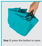
Step 1: press the button to open

A very robust umbrella from the Cambridge collection with DAS (Double Automatic System) and an antiwind system. The frame is made from metal and the handle is covered with ABS plastic for a safe grip and a nice feeling. It is ideal for women's handbags.