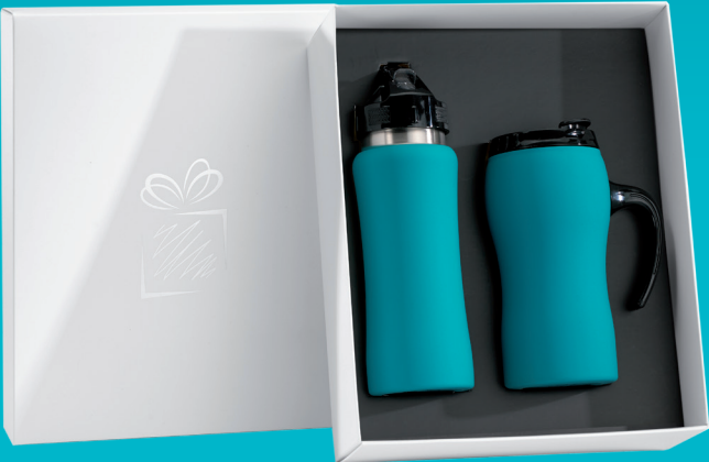
THERMAL MUG & WATER BOTTLE SET (HD01/HB01)