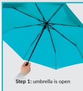
Step 1: umbrella is open