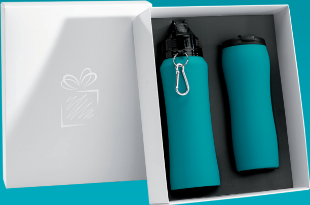
WATER BOTTLE & THERMAL MUG SET (HB02/HD02)