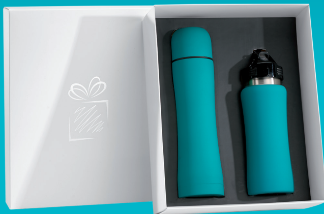
WATER BOTTLE & THERMOS SET (HB01/HT01)