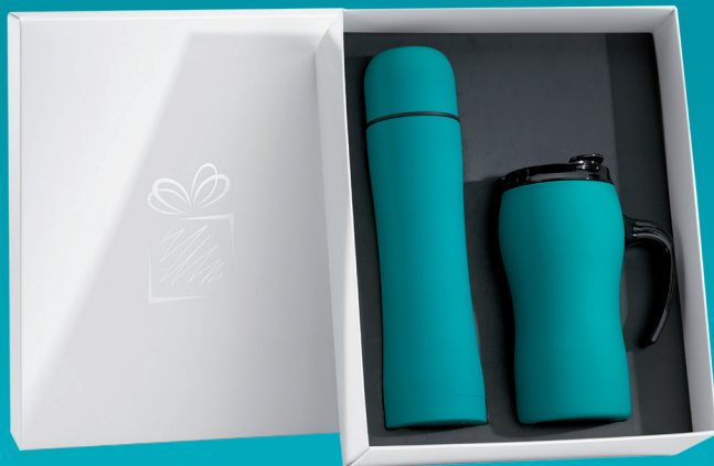
THERMAL MUG & THERMOS SET (HD01/HT01)