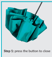
Step 1: press the button to close