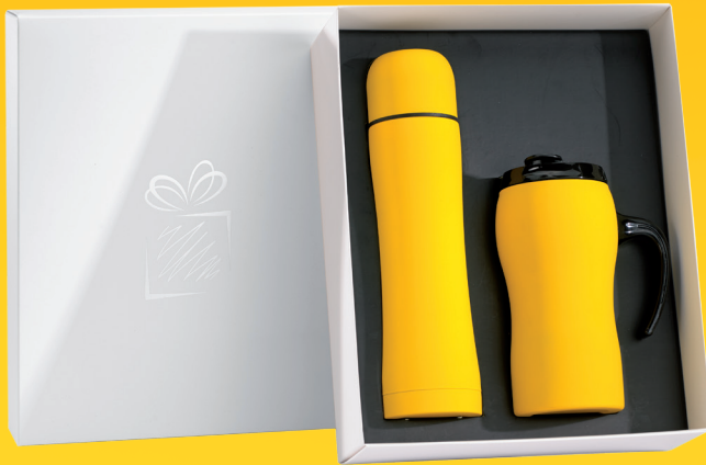
THERMAL MUG & THERMOS SET (HD01/HT01)