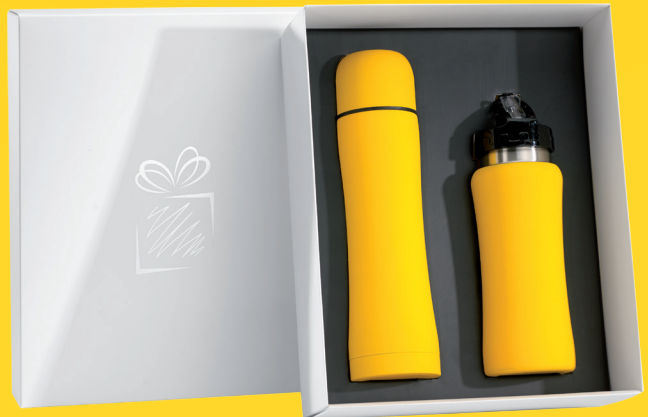
WATER BOTTLE & THERMOS SET (HB01/HT01)