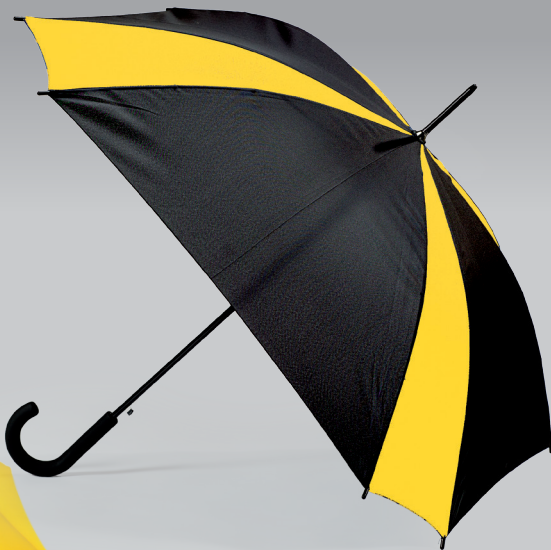
SAINT TROPEZ UMBRELLA (UP30)

A very robust umbrella from the Cambridge collection with DAS (Double Automatic System) and an antiwind system. The frame is made from metal and the handle is covered with ABS plastic for a safe grip and a nice feeling. It is ideal for women's handbags.