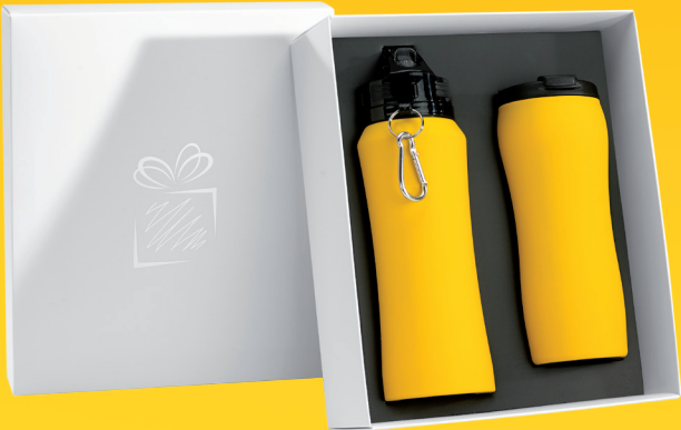
WATER BOTTLE & THERMAL MUG SET (HB02/HD02)