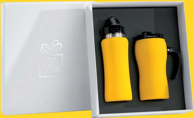
THERMAL MUG & WATER BOTTLE SET (HD01/HB01)