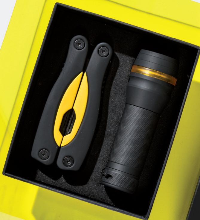
SET: MULTITOOL RUBBY & LED TORCH RUBBY (MM04/MT02)

Robust Rubby set for many occasions. Metal large multitool and flashlight covered with rubber. Set packed in an elegant black gift box.