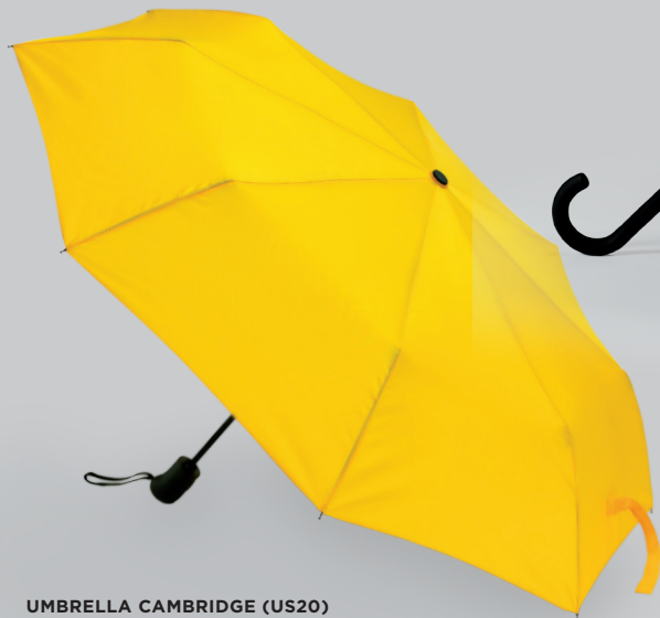
UMBRELLA CAMBRIDGE (US20)

A very robust umbrella from the Cambridge collection with DAS (Double Automatic System) and an antiwind system. The frame is made from metal and the handle is covered with ABS plastic for a safe grip and a nice feeling. It is ideal for women's handbags.