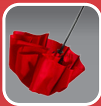
DAS system: 2. press the button to close