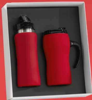
Drinkware set: Water Bottle, 600 ml. & Thermal Mug, 450 ml. HB01/HD01