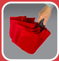
DAS system: 1. press the button to open