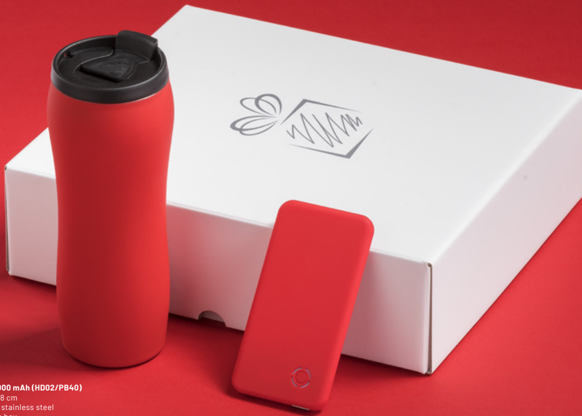
THERMAL MUG 450 ML & RAY POWER BANK 4000 mAh (HD02/PB40)