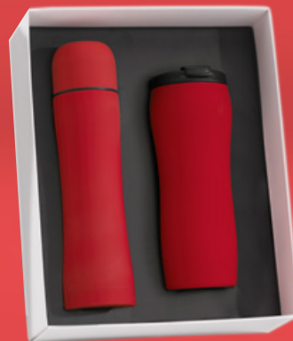
Drinkware set: Thermal Mug, 450 ml. & Thermos, 500 ml. HD02/HT01