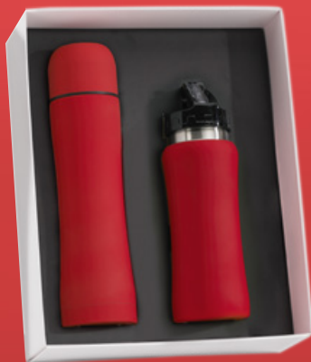
Drinkware set: Thermos, 500 ml. & Water Bottle, 600 ml. HT01/HB01