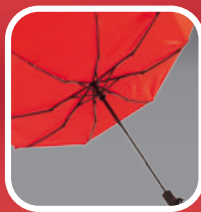
ANTI WIND system