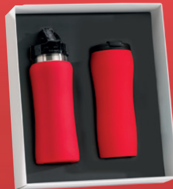
Drinkware set: Water Bottle, 600 ml. & Thermal Mug, 450 ml. HB01/HD02