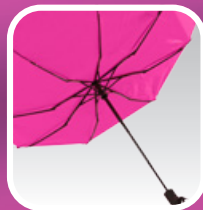
ANTI WIND system