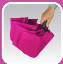
DAS system: 1. press the button to open