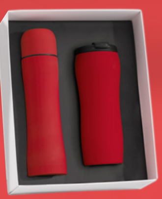
Drinkware set: Thermal Mug, 450 ml. & Thermos, 500 ml. HD02/HT01