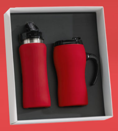
Drinkware set: Water Bottle, 600 ml. & Thermal Mug, 450 ml. HB01/HD01