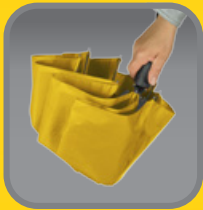
DAS system: 1. press the button to open