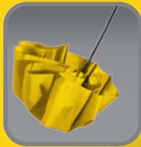
DAS system: 2. press the button to close