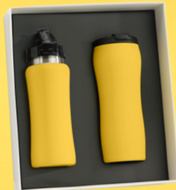
Drinkware set: Water Bottle, 600 ml. & Thermal Mug, 450 ml. HB01/HD02