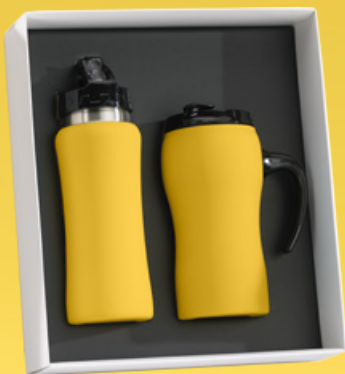
Drinkware set: Water Bottle, 600 ml. & Thermal Mug, 450 ml. HB01/HD01