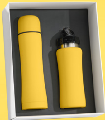
Drinkware set: Thermos, 500 ml. & Water Bottle, 600 ml. HT01/HB01