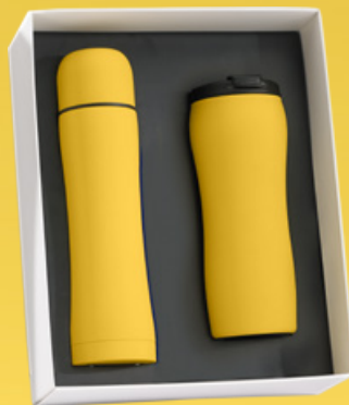
Drinkware set: Thermal Mug, 450 ml. & Thermos, 500 ml. HD02/HT01