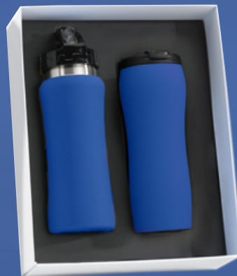
Drinkware set: Water Bottle, 600 ml. & Thermal Mug, 450 ml. HB01/HD02