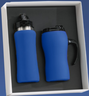
Drinkware set: Water Bottle, 600 ml. & Thermal Mug, 450 ml. HB01/HD01