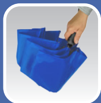
DAS system: 1. press the button to open