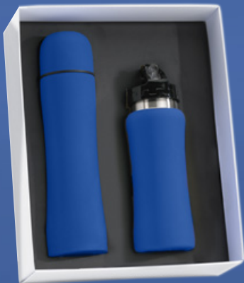
Drinkware set: Thermos, 500 ml. & Water Bottle, 600 ml. HT01/HB01