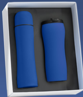
Drinkware set: Thermal Mug, 450 ml. & Thermos, 500 ml. HD02/HT01