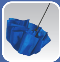
DAS system: 2. press the button to close