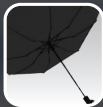
ANTI WIND system