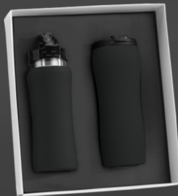
Drinkware set: Water Bottle, 600 ml. & Thermal Mug, 450 ml. HB01/HD02