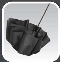
DAS system: 2. press the button to close