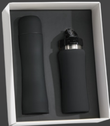
Drinkware set: Thermos, 500 ml. & Water Bottle, 600 ml. HT01/HB01