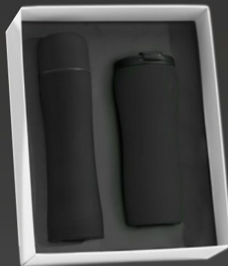
Drinkware set: Thermal Mug, 450 ml. & Thermos, 500 ml. HD02/HT01