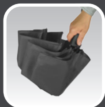
DAS system: 1. press the button to open