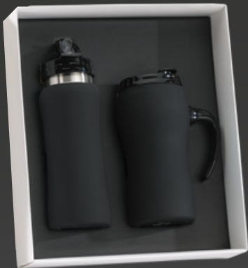
Drinkware set: Water Bottle, 600 ml. & Thermal Mug, 450 ml. HB01/HD01