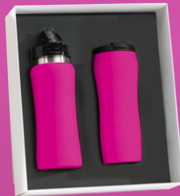
Drinkware set: Water Bottle, 600 ml. & Thermal Mug, 450 ml. HB01/HD02