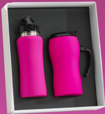
Drinkware set: Water Bottle, 600 ml. & Thermal Mug, 450 ml. HB01/HD01