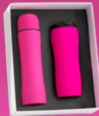
Drinkware set: Thermal Mug, 450 ml. & Thermos, 500 ml. HD02/HT01