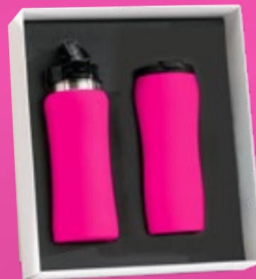
Drinkware set: Water Bottle, 600 ml. & Thermal Mug, 450 ml. HB01/HD02