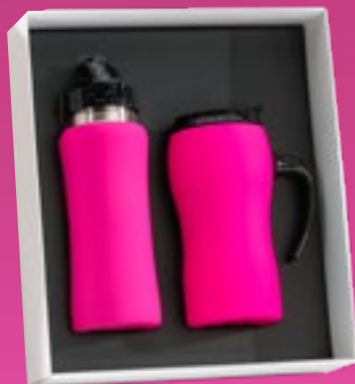
Drinkware set: Water Bottle, 600 ml. & Thermal Mug, 450 ml. HB01/HD01