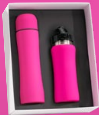
Drinkware set: Thermos, 500 ml. & Water Bottle, 600 ml. HT01/HB01