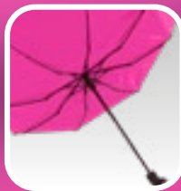
ANTI WIND system