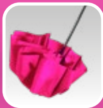
DAS system: 2. press the button to close