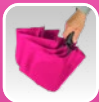
DAS system: 1. press the button to open