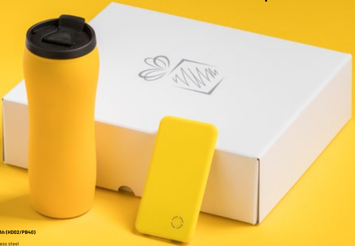
THERMAL MUG 450 ML & RAY POWER BANK 4000 mAh (HD02/PB40) Dimensions: 24,5x31x9,8 cm Materials: ABS, plastic, stainless steel Packing: elegant carton box