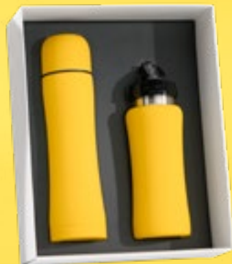
Drinkware set: Thermos, 500 ml. & Water Bottle, 600 ml. HT01/HB01