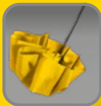
DAS system: 2. press the button to close