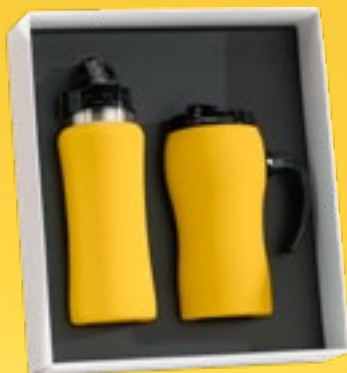
Drinkware set: Water Bottle, 600 ml. & Thermal Mug, 450 ml. HB01/HD01