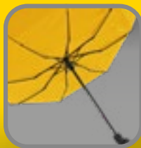
ANTI WIND system