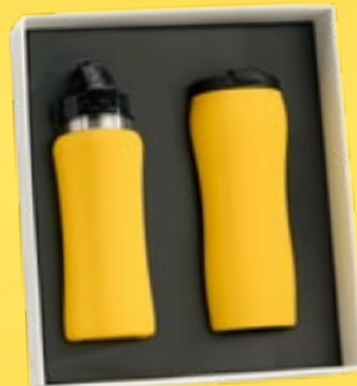
Drinkware set: Water Bottle, 600 ml. & Thermal Mug, 450 ml. HB01/HD02