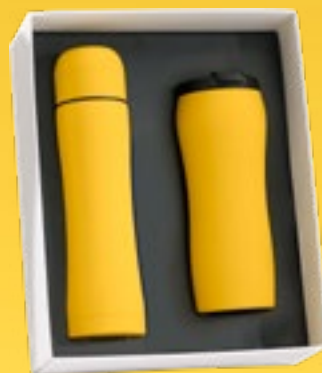
Drinkware set: Thermal Mug, 450 ml. & Thermos, 500 ml. HD02/HT01