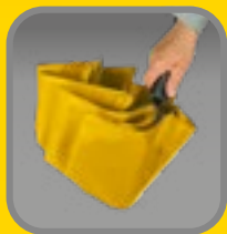
DAS system: 1. press the button to open