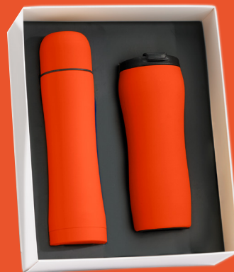
Drinkware set: Thermal Mug, 450 ml. & Thermos, 500 ml. HD02/HT01