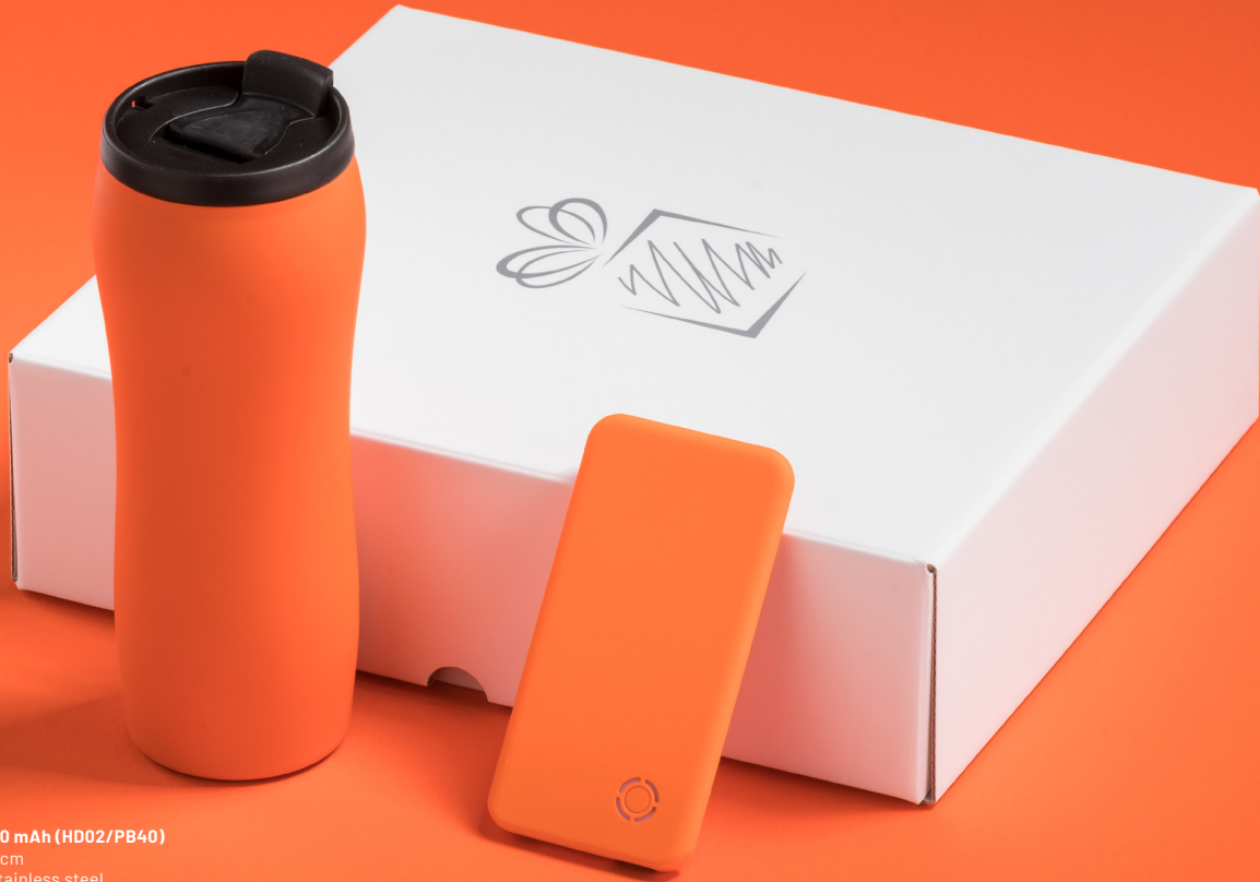
THERMAL MUG 450 ML & RAY POWER BANK 4000 mAh (HD02/PB40) Dimensions: 24,5x31x9,8 cm Materials: ABS, plastic, stainless steel Packing: elegant carton box