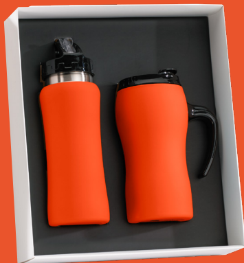
Drinkware set: Water Bottle, 600 ml. & Thermal Mug, 450 ml. HB01/HD01