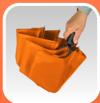
DAS system: 1. press the button to open