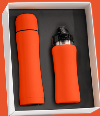
Drinkware set: Thermos, 500 ml. & Water Bottle, 600 ml. HT01/HB01