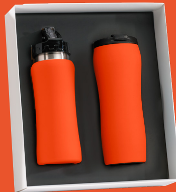
Drinkware set: Water Bottle, 600 ml. & Thermal Mug, 450 ml. HB01/HD02