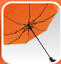
ANTI WIND system