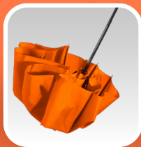
DAS system: 2. press the button to close