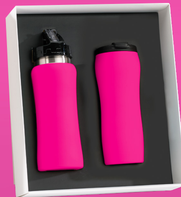
Drinkware set: Water Bottle, 600 ml. & Thermal Mug, 450 ml. HB01/HD02