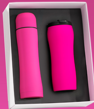
Drinkware set: Thermal Mug, 450 ml. & Thermos, 500 ml. HD02/HT01