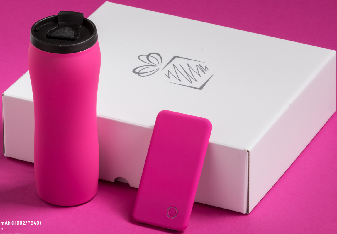
THERMAL MUG 450 ML & RAY POWER BANK 4000 mAh (HD02/PB40) Dimensions: 24,5x31x9,8 cm Materials: ABS, plastic, stainless steel Packing: elegant carton box