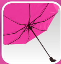
ANTI WIND system