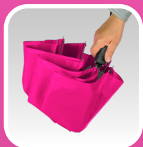
DAS system: 1. press the button to open