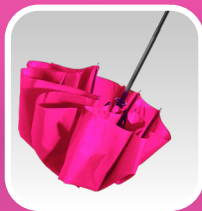
DAS system: 2. press the button to close