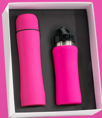
Drinkware set: Thermos, 500 ml. & Water Bottle, 600 ml. HT01/HB01