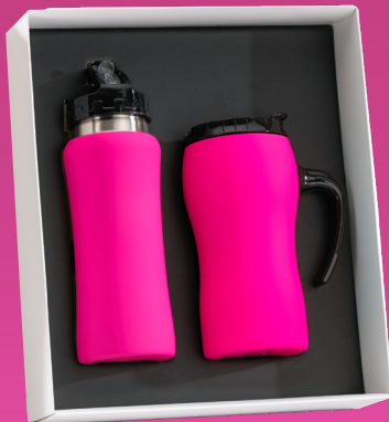
Drinkware set: Water Bottle, 600 ml. & Thermal Mug, 450 ml. HB01/HD01