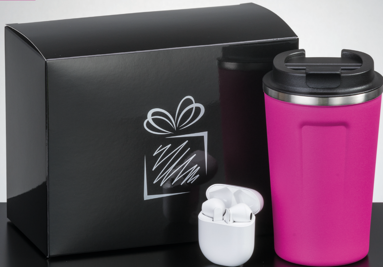
NORDIC COFFEE MUG & TWS ACTIVE EARPHONES HCM01/PH30

Materials: 18/8 POSCO stainless steel, silicone, powder coating, ABS Packing: black gift box Printing: engraving, UV printing, pad printing Certificates: Food Contact, BPA FREE, REACH, ROHS, FDA, LFGB, EMC