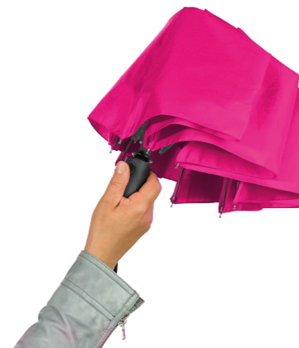
Step 1: press the button to open