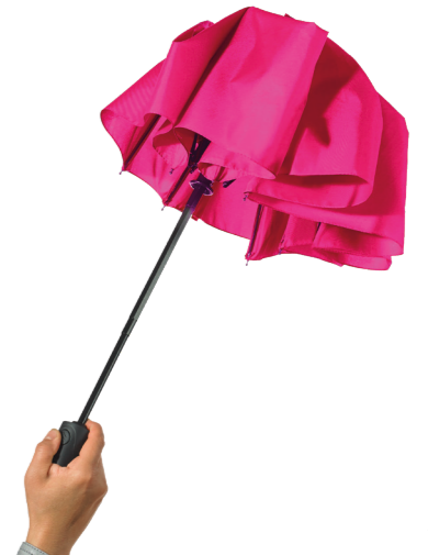
Step 3: press the button to close