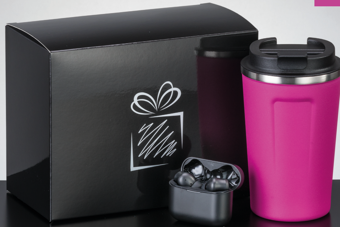
NORDIC COFFEE MUG & TWS DYNAMIC EARPHONES HCM01/PH40

Materials: 18/8 POSCO stainless steel, silicone, powder coating, ABS Packing: black gift box Printing: engraving, UV printing, pad printing Certificates: Food Contact, BPA FREE, REACH, ROHS, FDA, LFGB, EMC