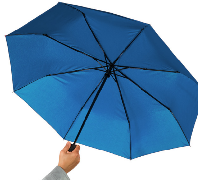
Step 2: umbrella is open