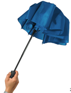
Step 3: press the button to close