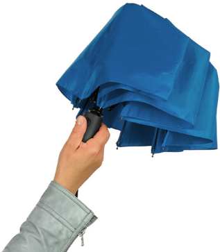
Step 1: press the button to open