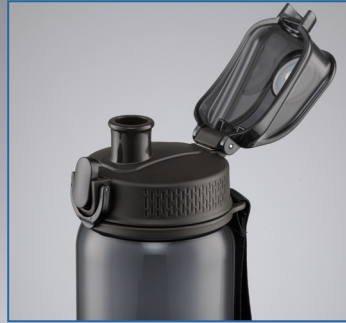
ONE CLICK OPENING