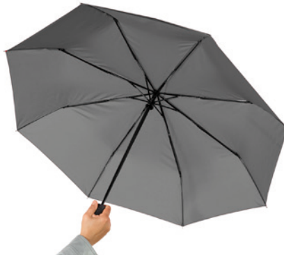
Step 2: umbrella is open