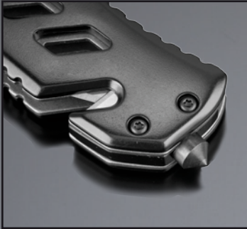
WINDOW BREAKER & BELT CUTTER