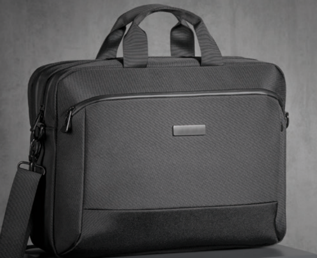
BIZZ PRO DOUBLE-COMPARTMENT LAPTOP BAG 15" LLN430