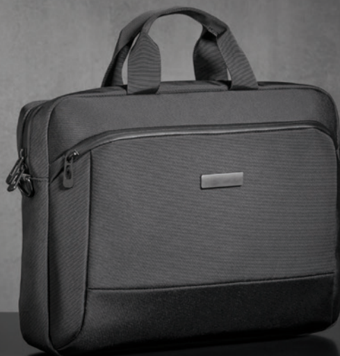
BIZZ PRO SINGLE-COMPARTMENT LAPTOP BAG 15" LLN420