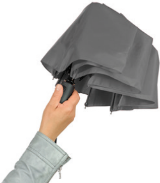
Step 1: press the button to open