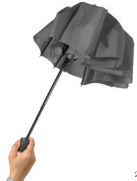
Step 3: press the button to close