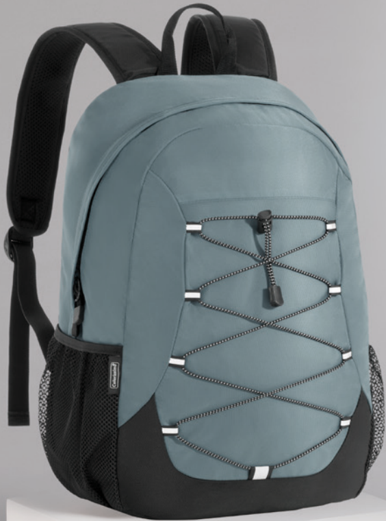
NORDIC TWO-COMPARTMENT BACKPACK 15" LPN320