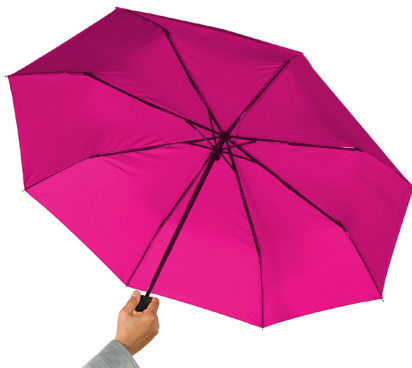
Step 2: umbrella is open