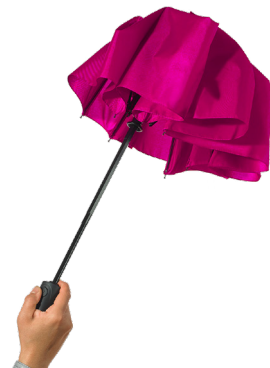
Step 3: press the button to close