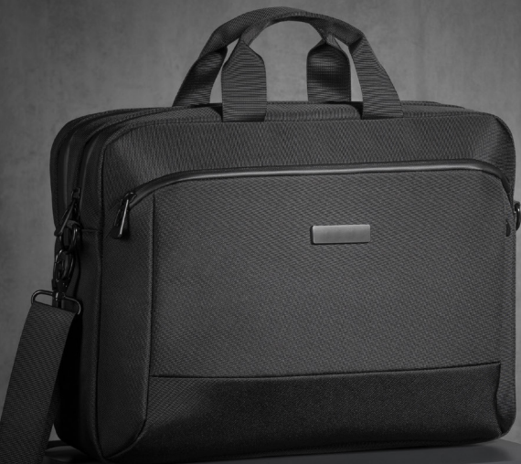
BIZZ PRO DOUBLE-COMPARTMENT LAPTOP BAG 15" LLN430