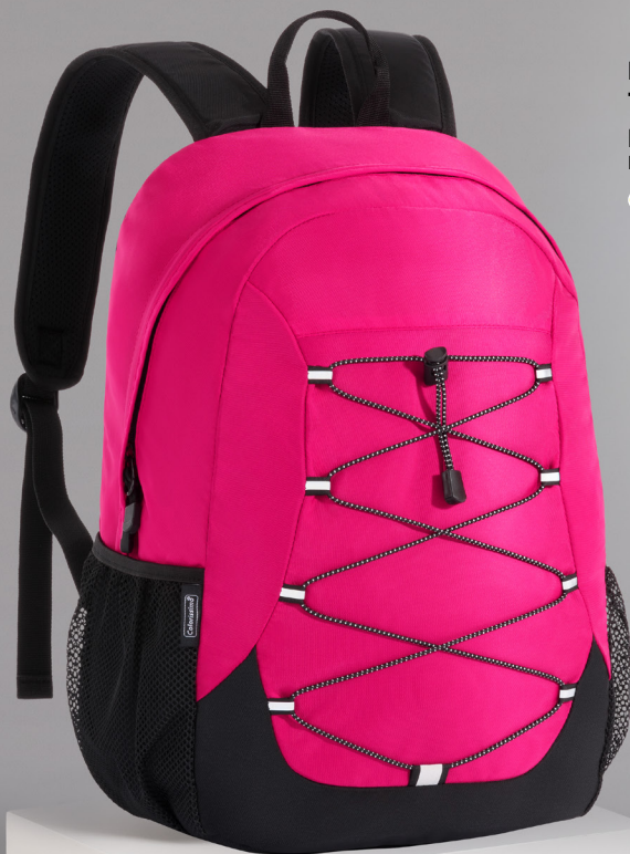
NORDIC TWO-COMPARTMENT BACKPACK 15" LPN320