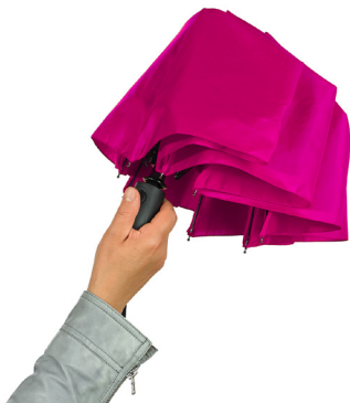
Step 1: press the button to open