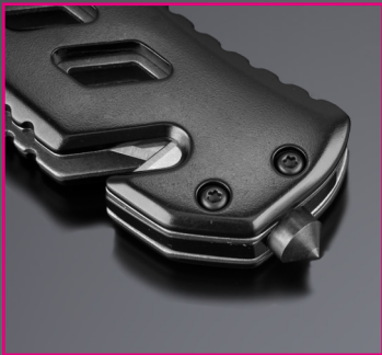
WINDOW BREAKER & BELT CUTTER