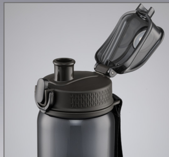
ONE CLICK OPENING