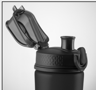
ONE CLICK OPENING