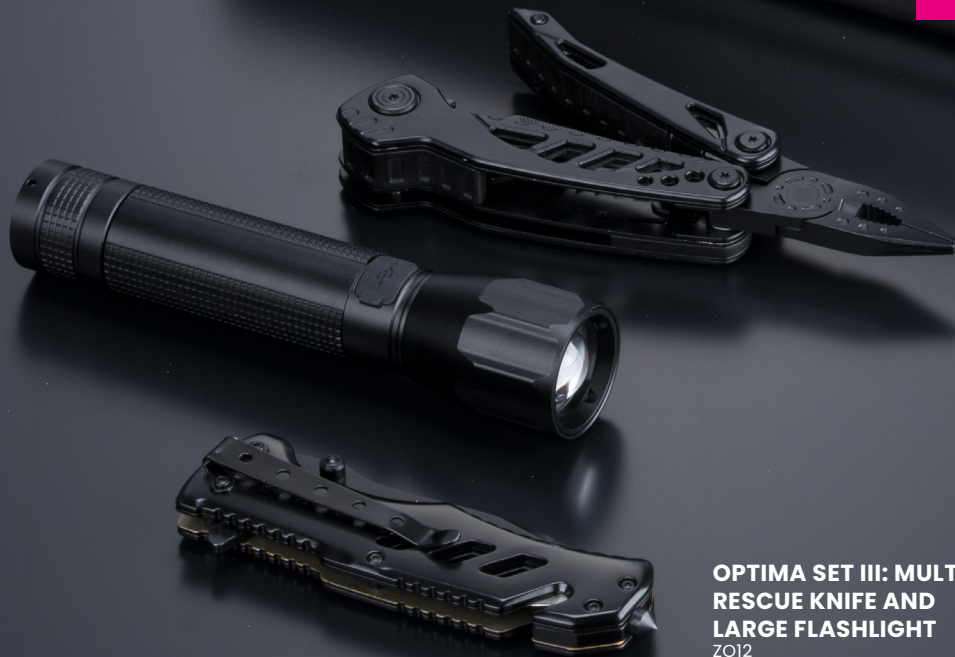
OPTIMA SET III: MULTITOOL, RESCUE KNIFE AND LARGE FLASHLIGHT Z012