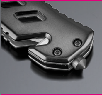
WINDOW BREAKER & BELT CUTTER