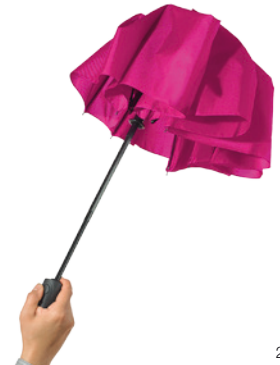
Step 3: press the button to close