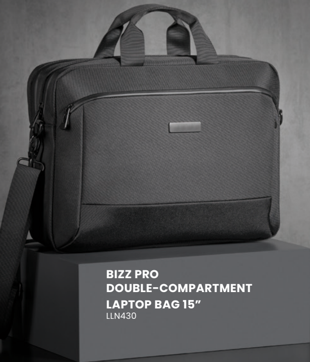
BIZZ PRO DOUBLE-COMPARTMENT LAPTOP BAG 15" LLN430