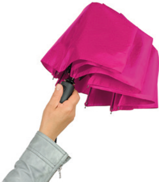
Step 1: press the button to open