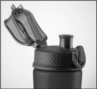
ONE CLICK OPENING