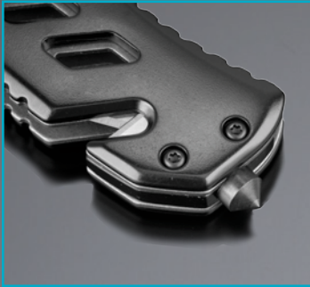
WINDOW BREAKER & BELT CUTTER