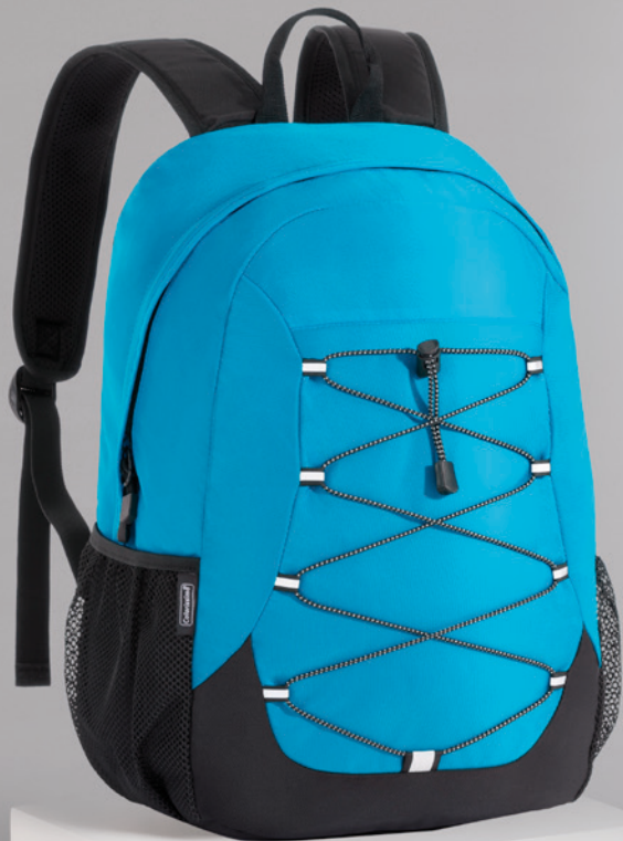
NORDIC TWO-COMPARTMENT BACKPACK 15" LPN320