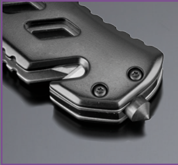
WINDOW BREAKER & BELT CUTTER