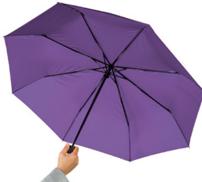
Step 2: umbrella is open