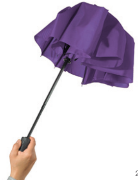
Step 3: press the button to close