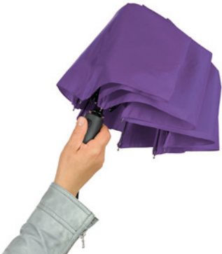
Step 1: press the button to open