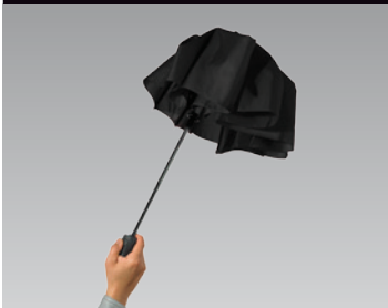
DAS system: 2. press the button to close