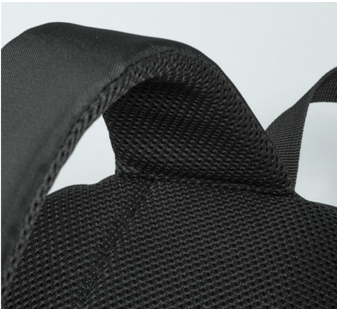
foam-padded back panel