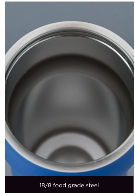
18/8 food grade steel