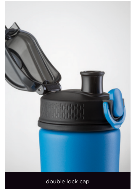
double lock cap