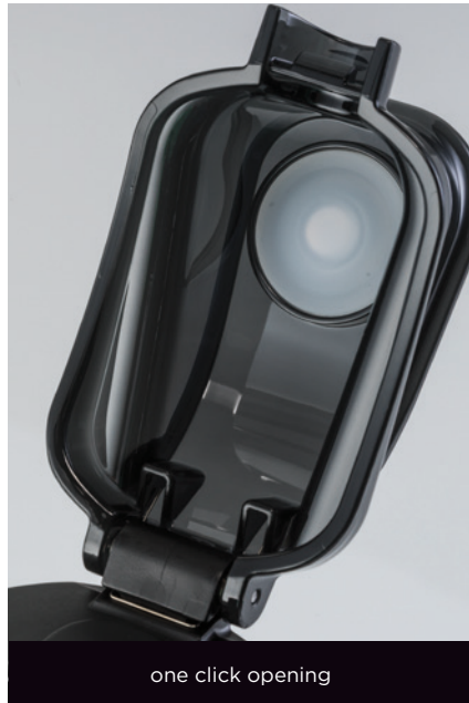
one click opening