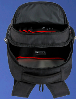
BACKPACK CITY 15" LPN630

The backpack features a spacious main compartment with a 15" laptop pocket, additional pockets for small business accessories, and two side pockets. Reinforced back for comfort while carrying.