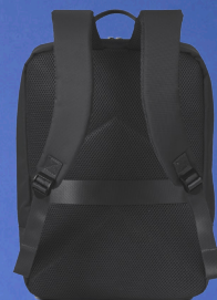
MISTRAL BACKPACK LPN200

A lightweight and comfortable backpack with additional reinforcements to maintain its unique shape regardless of its contents. Built-in sleeve for a 15" laptop.