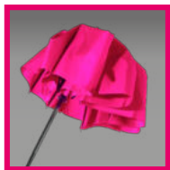
DAS system: 1. press the button to open