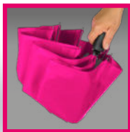
DAS system: 2. press the button to close