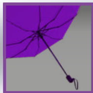
ANTI WIND system