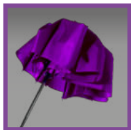
DAS system: 1. press the button to open