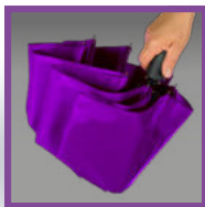
DAS system: 2. press the button to close