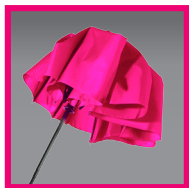
DAS system: 1. press the button to open