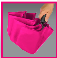
DAS system: 2. press the button to close