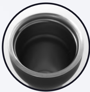
double steel wall