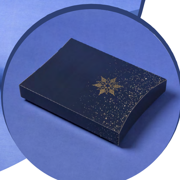
Christmas box included