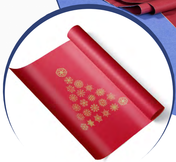
Christmas foil included