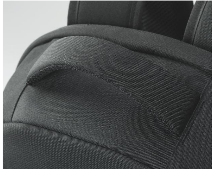
SOLID HANDLE AND STRAPS