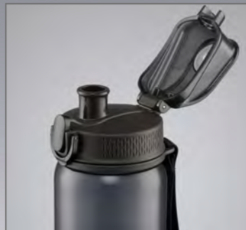
ONE CLICK OPENING