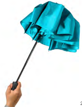
Step 3: press the button to close