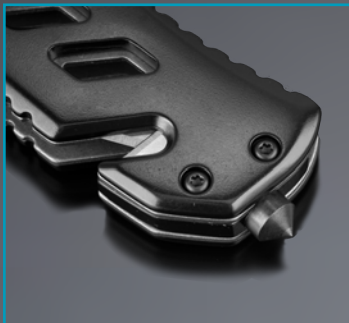
WINDOW BREAKER & BELT CUTTER