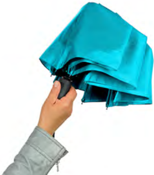
Step 1: press the button to open