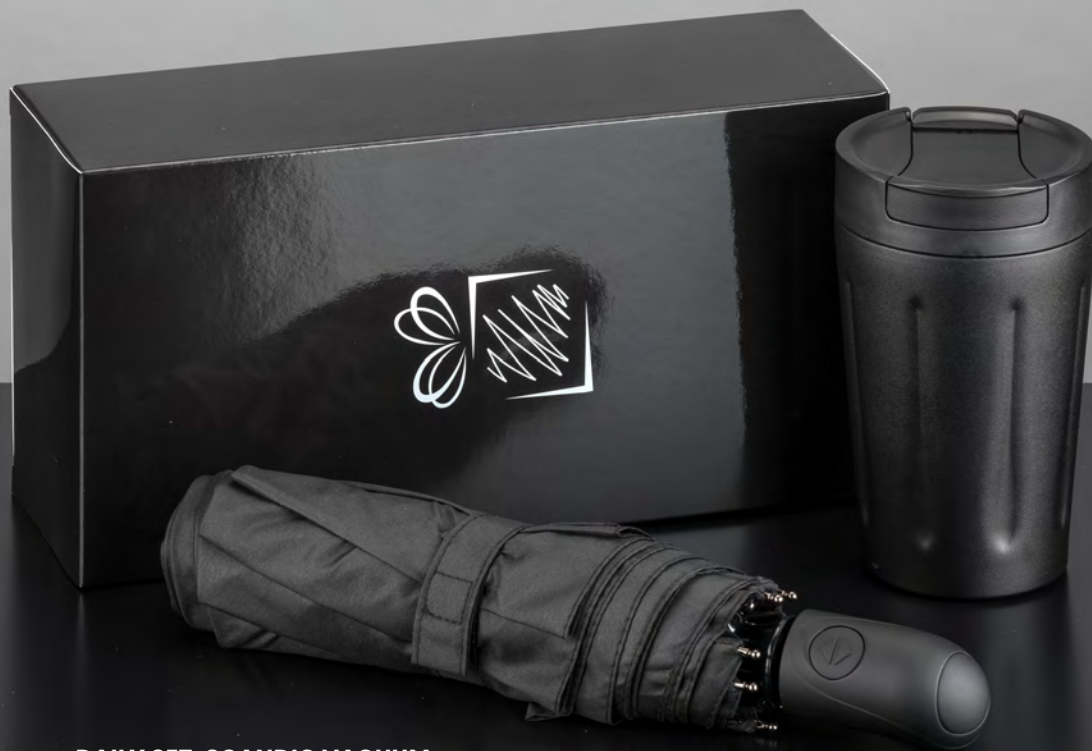
DAILY SET: SCANDIC VACUUM COFFEE MUG, 350 ML AND CAMBRIDGE UMBRELLA ZS11