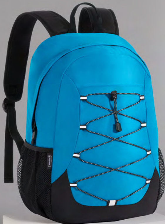
NORDIC TWO-COMPARTMENT BACKPACK 15" LPN320