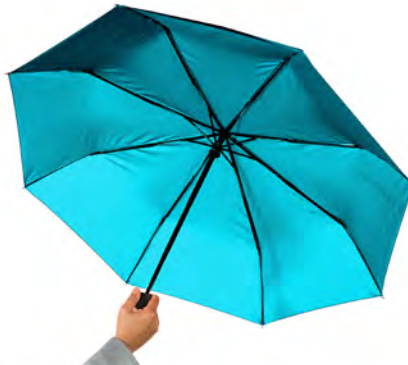
Step 2: umbrella is open